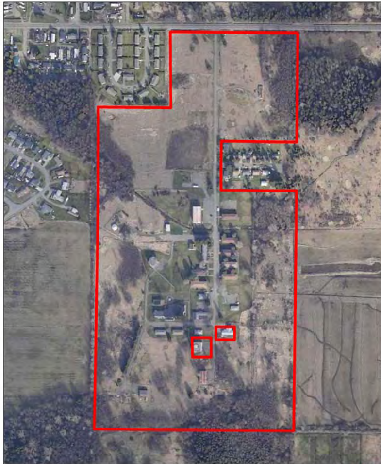
Bay Horizon Park